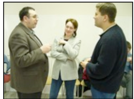
Upper: Students in class